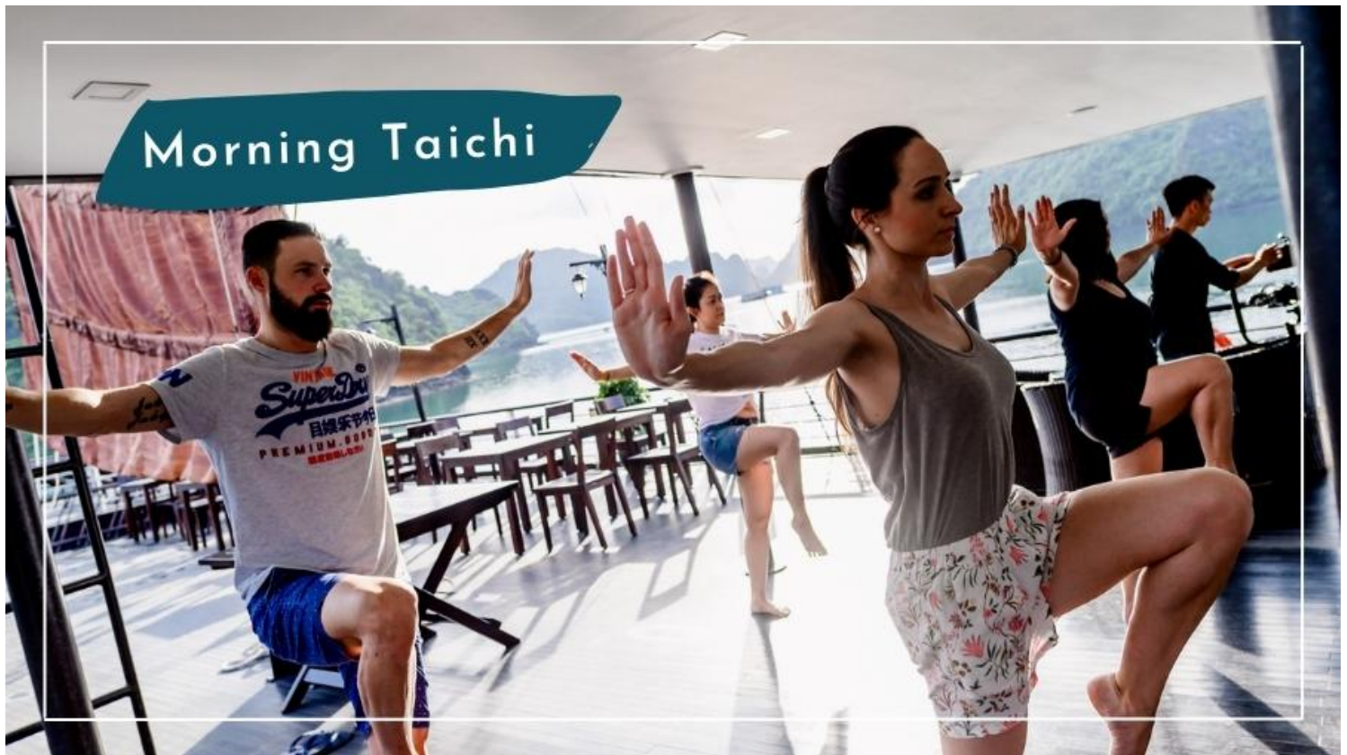
Tai Chi on Sun Deck of Mon Cheri Cruise