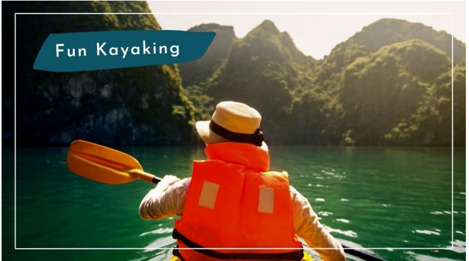
Rowing boat or Kayaking in Mon Cheri itinerary

Note: You will have a short break before the afternoon itinerary starts.